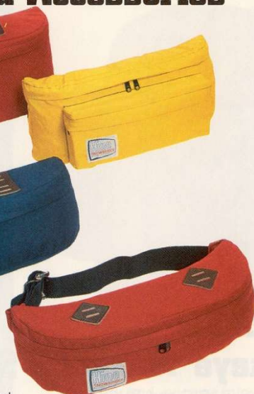
Powell Packs—Large, Regular, Small, HineQuarter.

The three POWELL PACKS and HINEQUARTER are primarily designed for ski touring, bicycling and hiking where shoulder freedom and low center of gravity are an advantage. These packs are designed to be worn around the waist, thus completely freeing the wearer's shoulders and moving the weight down for better balance. Features include two sliders on the zipper for quick and easy access, two accessory strap holders on top (except on the HINEQUARTER) for strapping on extra items and a wide 2" waist belt for added carrying comfort. Each model is contoured for a better fit against the user's back and is light enough to be carried as a second pack inside a frame pack. In addition to the above features, the HINEQUARTER has an extra pocket for the individual who wants to separate his equipment.